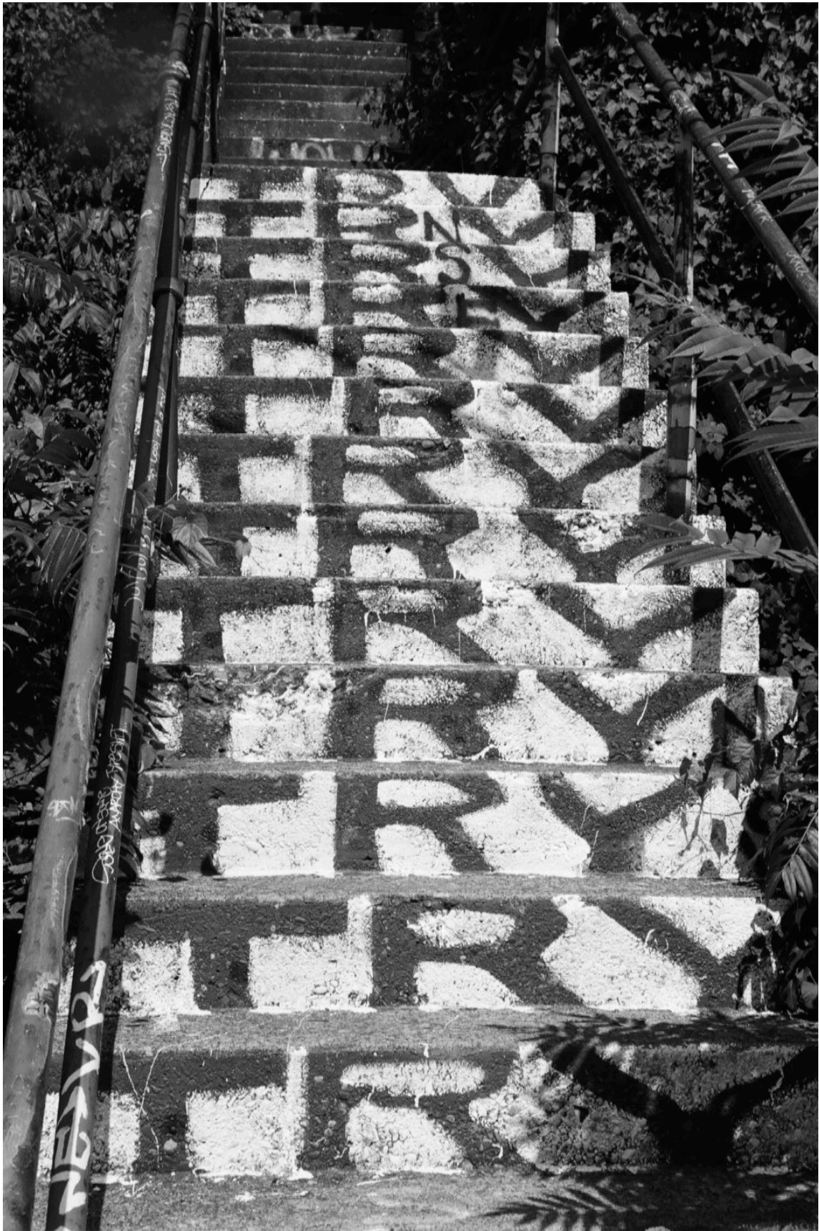
NSF Try and Try again taken in Sep of 2009. I do not know the name of this location though still know how to get there. I find this photo to be optimistic, try and try again, climb your mountain before it climbs you.